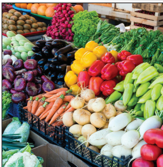
The next Black Farmers' Market is May 24, 1-4 p.m., 2718 Rock Quarry Road

A shred-a-thon and medication takeback is May 29, 10 a.m. to 1 p.m., Seymour Center, 2551 Homestead Road.