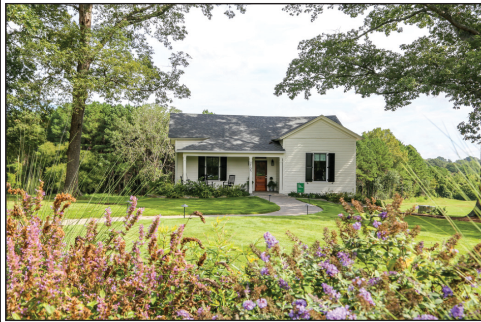
Flowers Cottage after renovation