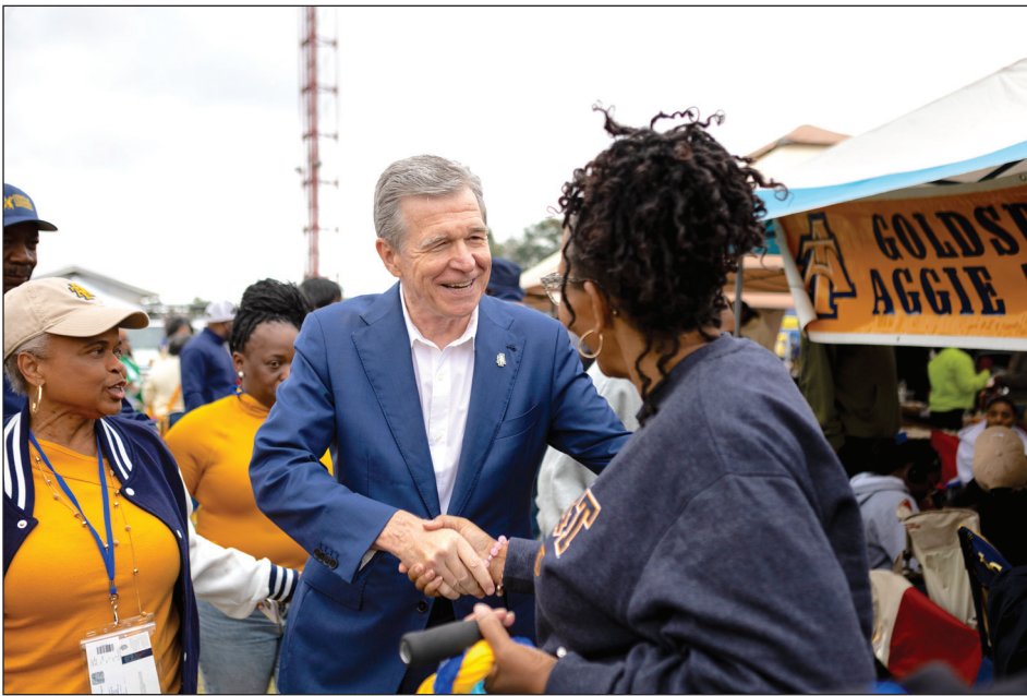
U.S. Senate Democratic candidate Roy Cooper greets fans at North Carolina A&T State University in Greensboro.